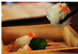
Gloriously tasty fare draws the foodie faithful