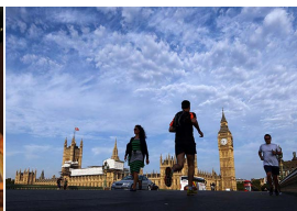
Top 10 easiest places in the world to do business